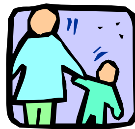
Our Board Members help build families!

Board Members are expected to faithfully attend meetings and contribute their ideas and time to help find families for God's children. It is not an easy task and it can be time consuming, but it is also a blessing to be used by God for His purposes. Please prayerfully consider this possibility.