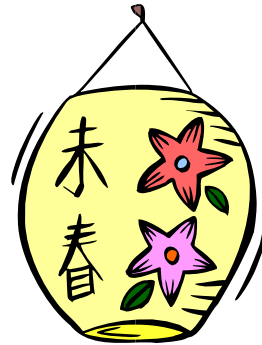
Chinese New Year for 2006 occurred on JANUARY 29!

ered a the birthday of all humans and is a day for farmers to display their produce. The 9th day is marked by an offering for the Jade Emperor. The 10th through the 12th days are celebrated by inviting friends and relatives over for dinner. The 13th day, a mixture of simple rice congee and mustard greens is eaten to cleanse the system. The 14th day is spent preparing for the lantern Festival, which is celebrated on the 15th. Chinese people may not believe the same superstitions that characterized